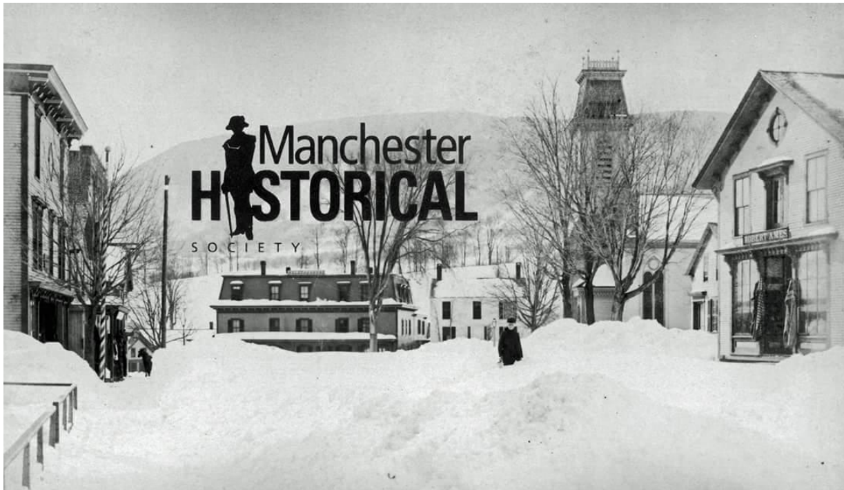
The blizzard of 1888.